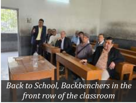
Back to School, Backbenchers in the front row of the classroom

The auspicious celebration of Saraswati Puja was observed with devotion and enthusiasm at our school, Rotary Shiksha Kendra, on 23rd January 2026 from 10 a.m. onwards.