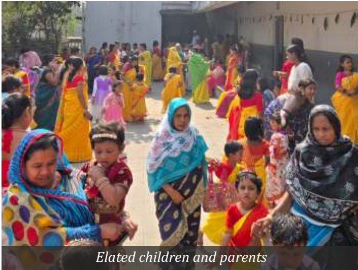
Elated children and parents