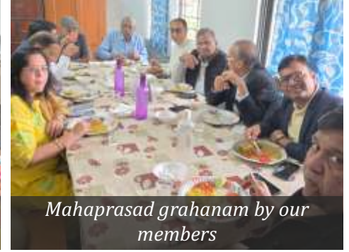
Mahaprasad grahanam by our members