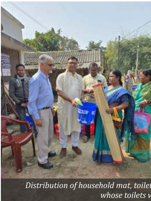
Distribution of household mat, toilet cleaning and usable items to families whose toilets were constructed