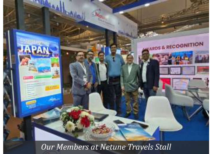
Our Members at Netune Travels Stall