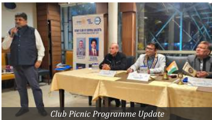
Club Picnic Programme Update