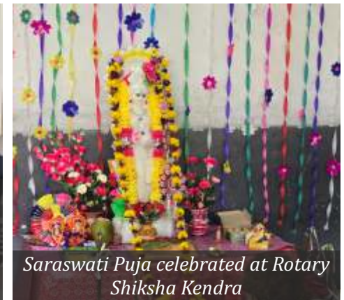
Saraswati Puja celebrated at Rotary Shiksha Kendra