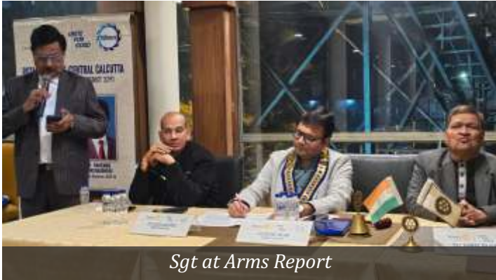
Sgt at Arms Report