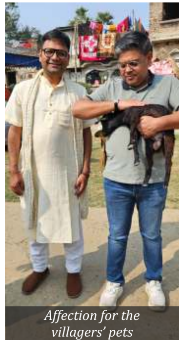
Affection for the villagers' pets