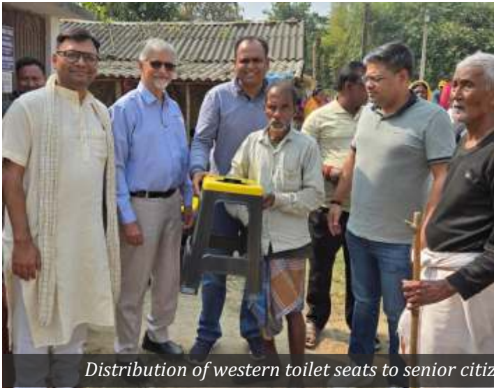
Distribution of western toilet seats to senior citizens with knee problems with explanation on usage