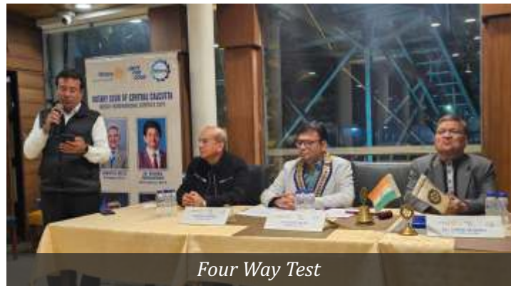
Four Way Test