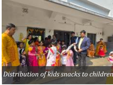
Distribution of kids snacks to children